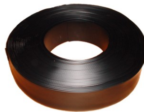
125mm x 100m Welding Strip

For Full details and technical data, please contact us at: